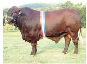
Rosevale Park Marshall F10