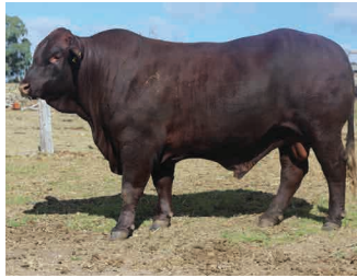
Rosevale Park Beaumon J8