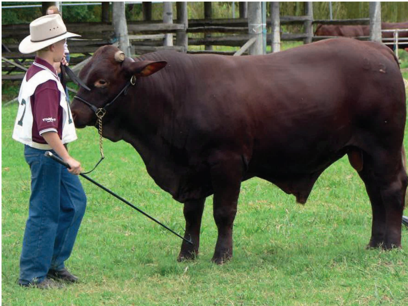
Rosevale Park Marshall B12