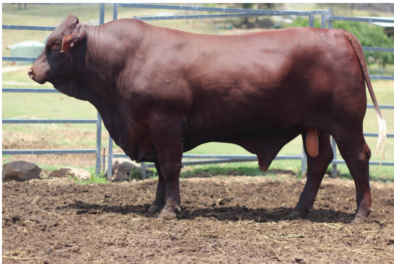
Rosevale Park Statesman M10