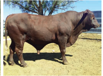
Rosevale Park Beaumon M12