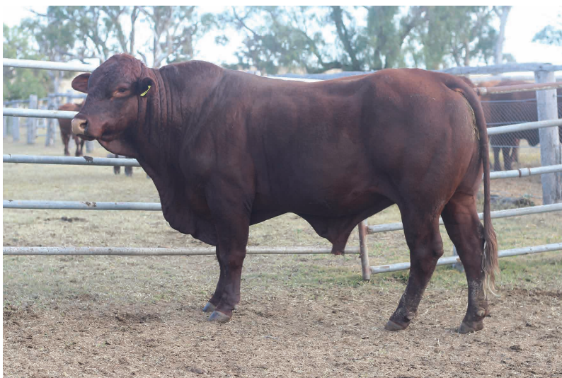
Rosevale Park Pharoah H4