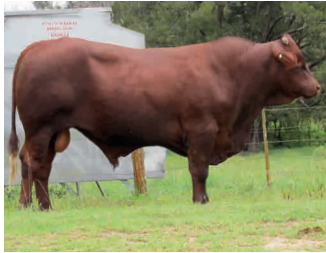
Rosevale Park Oyster E12