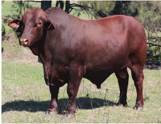
Rosevale Park Beaumon K20